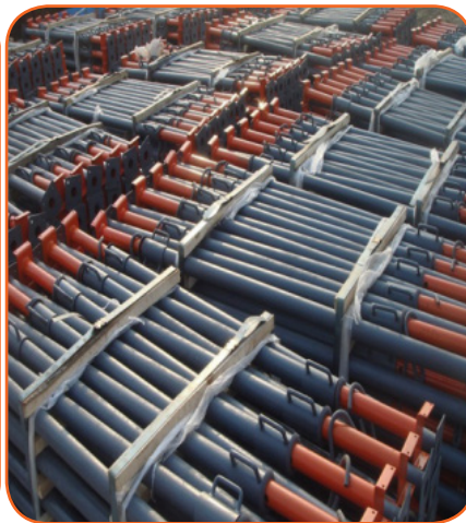
Product picture show