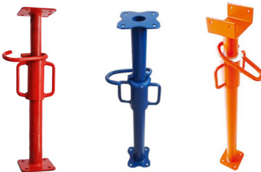
Cup type steel prop