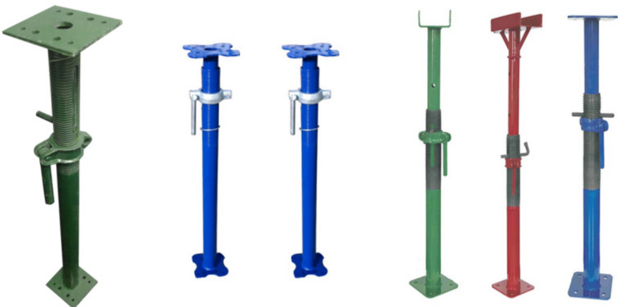
Common steel prop